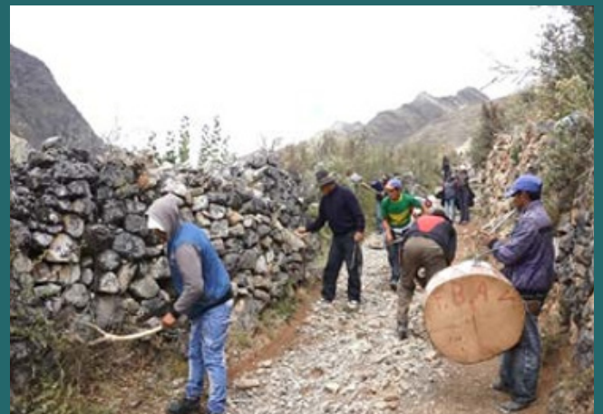
Traditional conservation of the Qhapac Ñan