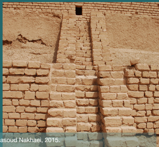
Drainage System in the Tchogha Zanbil ziggurat (2nd millennium BC).