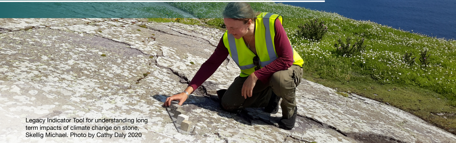
Legacy Indicator Tool for understanding long term impacts of climate change on stone, Skellig Michael.

V ulnerability to the impacts of climate change depends on exposure, sensitivity, and adaptive capacity and deliberate efforts to increase the capacity to cope with (or avoid) the impacts of climate change are now needed. Climate adaptation planning and policy can happen at all scales, and adaptation actions can include both individual and collective measures.