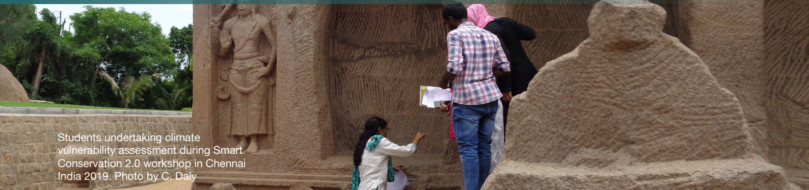
Students undertaking climate vulnerability assessment during Smart Conservation 2.0 workshop in Chennai India 2019.

C limate change has become one of the most significant and fastest growing threats to people and their cultural heritage worldwide. Scientific evidence shows that unprecedented concentrations of greenhouse gases (GHGs), driven by human activities such as burning of fossil fuels and deforestation, are heating the globe and driving climate change and instability. The impacts of these changes are already damaging infrastructure, natural and social systems – including cultural heritage – that provide essential benefits and quality of life to communities.