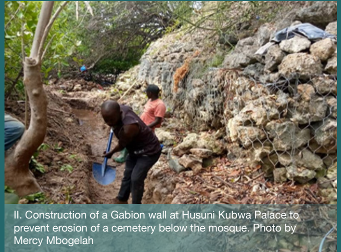
II. Construction of a Gabion wall at Husuni Kubwa Palace to prevent erosion of a cemetery below the mosque.