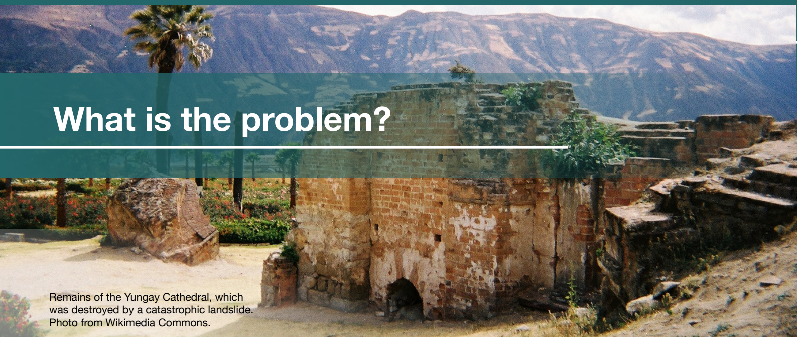
Remains of the Yungay Cathedral, which was destroyed by a catastrophic landslide.

A daptation aims to minimise the adverse consequences of climate change and maximise the opportunities it presents. Adaptation actions can include behavioural, institutional, and technological adjustments.