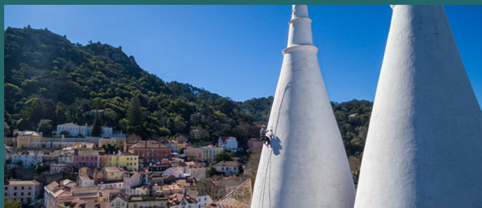
Maintenance action with the use of lime.

Energy, water and material efficiency was increased by applying measures such as: More efficient lighting equipment, reduction of hours of outdoor lighting, timed taps, and rehabilitation of the water supply mines network, among others. By 2024 the measures developed will result in a reduction of 52.5 tonnes of oil equivalent/ year (21.86%); 13,368.10m 3 of water (26.01%), and a reduction of 28.08% of greenhouse gas emissions.