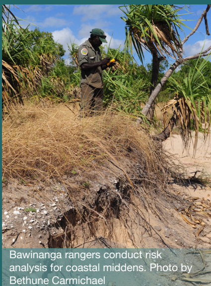
Bawinanga rangers conduct risk analysis for coastal middens.

The Adaptation Plan focussed on increasing ranger capability and capacity. It prioritised training in rock art conservation, to build site resilience, and in the use of the risk assessment tool. It also planned the development of a digitalised version of the tool for use on ranger tablets. It also acknowledged that sites would inevitably be lost or damaged. At these sites, documentation is essential before loss takes place. Rangers planned to develop a process for routinely making 3D models of sites and the incorporation of these models into augmented reality software. They envisaged the visualisation of lost or damaged sites via augmented reality ocular headsets at the actual site of loss.