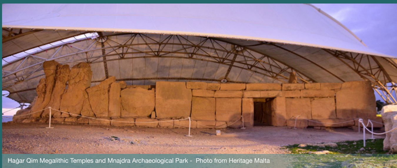
Haġar Qim Megalithic Temples and Mnajdra Archaeological Park - Photo from Heritage Malta

The Maltese Megalithic Temples, constructed between the mid-fourth and mid-third millennia BC, are unique and are amongst the oldest stone buildings of such complexity in the world. They are of great local and international significance, embodying symbolic, educational and recreational values. These free-standing Temples have been suffering from a series of severe problems associated with the deterioration of materials (limestone) as well as structural problems, seen in a number of serious collapses over the years. These vulnerable prehistoric structures have been protected from the direct impact of environmental factors by means of a temporary, open-sided shelter, conceived as a large parasol designed to be as light as possible, in visual as well as in physical terms.