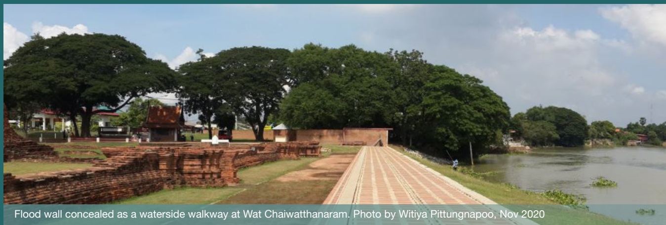
Flood wall concealed as a waterside walkway at Wat Chaiwatthanaram. Photo by Witiya Pittungnapoo, Nov 2020

The historic city fabric of Ayutthaya was crisscrossed by a network of canals enabling inhabitants to live with water and manage natural flood events. Over time however a great number of the canals fell into disuse resulting in a loss of spaces for retaining floodwater. The updated strategy combines restoration and maintenance of the ancient flood relief canals with the additional modern flood defences together with water management. This integrated and interdisciplinary approach that includes nature-based solutions and community participation will increase Ayutthaya's climate change resilience.