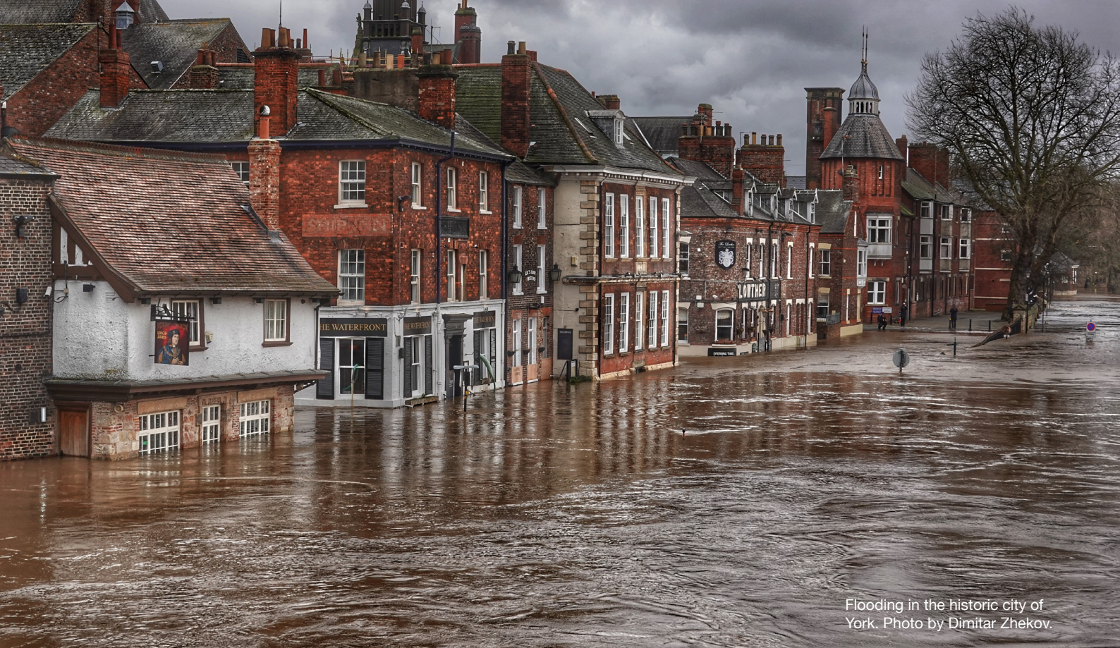
Flooding in the historic city of York.