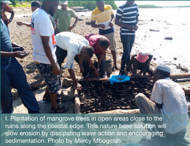
I. Plantation of mangrove trees in open areas close to the ruins along the coastal edge. This nature base solution will slow erosion by dissipating wave action and encouraging sedimentation.

These have mostly affected the ruins found along the coastal areas. For example, sea waves and tides cause erosion to the monuments located close to the ocean edge including Gereza/Portuguese Fort, Husuni Kubwa Palace, cemeteries and Malindi Mosque as Well as Makutani Palace while rainwater has caused erosion of the monuments surfaces. In response the site management have taken the following adaptation actions: