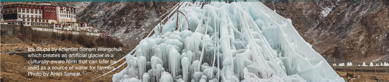
Ice Stupa by scientist Sonam Wangchuk which creates an artificial glacier in a culturally-aware form that can later be used as a source of water for farmers.

ICOMOS has been at the forefront of climate action within the heritage sector and its efforts have repeatedly emphasised the importance of sustainable adaptation. This resource is an extension of our work to date and focuses exclusively on issues of adaptation to climate change. Specific previous actions include: